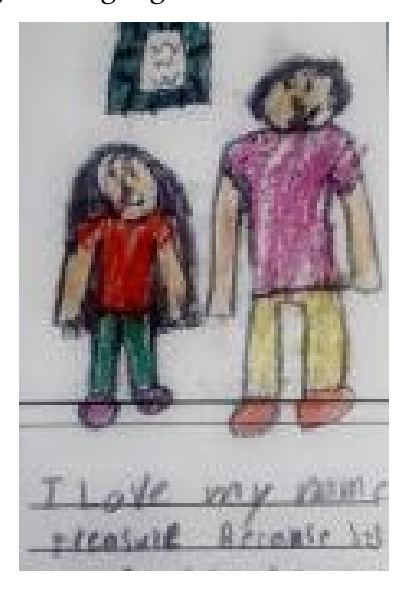
Figure 4. Sample writing from identity text.

Israa chose to share the Quran to make meaning of her name: