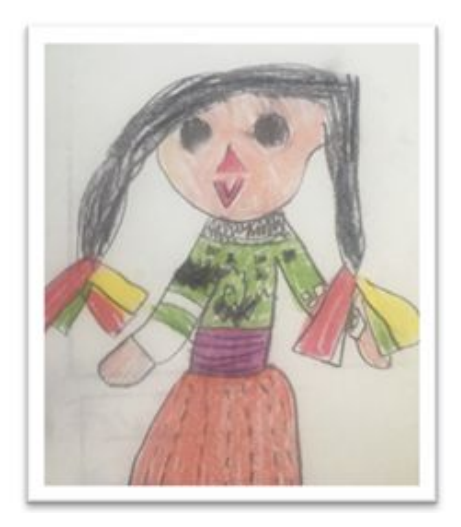
Figure 6. Student sample of a name artifact and an illustration from an identity text.

Figure 7 captures a sample of how Sabina used the target vocabulary in her identity text.