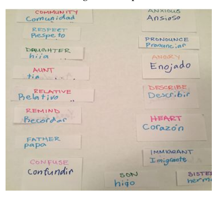
Figure 2. Sample of word play cards in English and Spanish.

vited to create word play cards for other words that they made connections to throughout the project. These words were incidental to the project but important to the overall vocabulary development process. During the lessons, the preservice teachers and/or the students initiated games to play with their cards. The students were invited to take these cards home to share with their parents, practice their words, and challenge themselves to include a first language translation of the target words. Figure 2 shows an exemplar of the word play cards translated in English and Spanish.