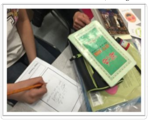
Figure 3. Sample of an English language learner's name artifact.

students' identities while incorporating the target vocabulary in meaningful ways. All names used are pseudonyms, and quoted material has been kept as close to the original as possible to preserve the participants' voices. I have boldfaced the target vocabulary from the literacy intervention in the students' identity text transcriptions. The first exemplar is a transcription of an identity text from Israa, a Grade 3 ELL born in Canada (see Figures 3 and 4).