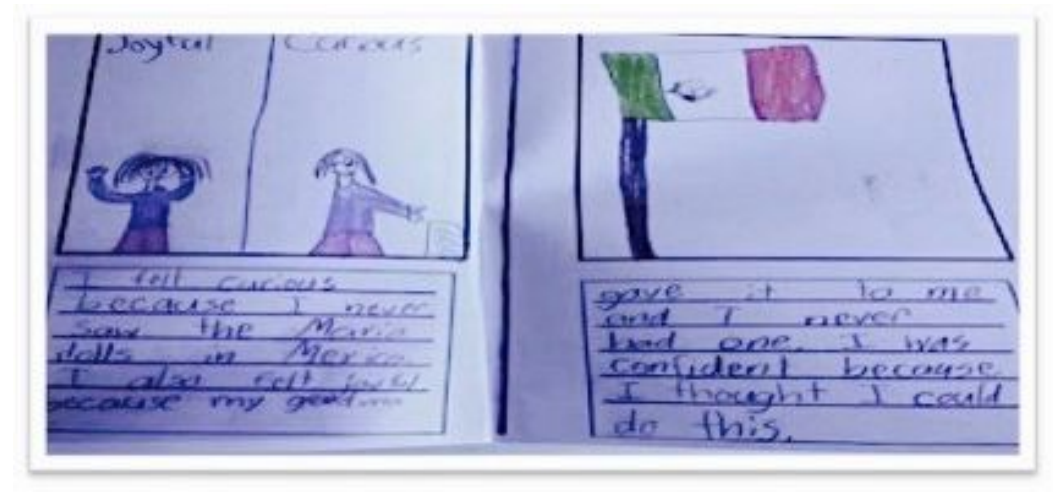
Figure 7. Student sample of target vocabulary in an identity text.

Figure 7 captures a sample of how Sabina used the target vocabulary in her identity text.