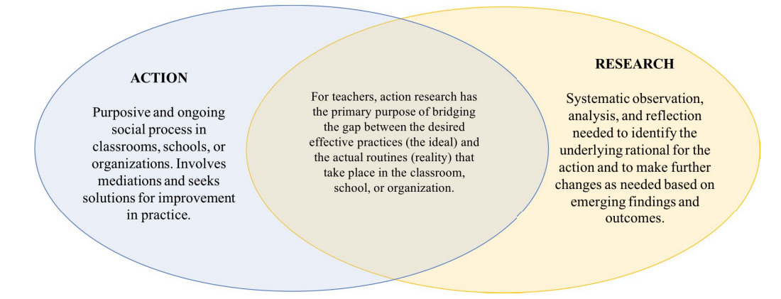
Figure 1: Definition and purpose of action research. Adapted from Burns (2009).

Mills (2007) explains that action research is "any systematic inquiry conducted by teacher researchers, principals, school counselors, or other stakeholders in the teaching/learning environment to gather information about how their particular schools operate, how they teach, and how well their students learn" (p. 5). Action research is done by teachers with the goal of gaining insight and developing reflective practices that positively influence their students' outcomes and contribute to the improvement of their own educational practices in general. From a practical perspective, action research focuses on a how-to approach and assumes that individual teachers are autonomous, competent, and committed to life-long professional development (Mills, 2007). More important, action research is the tool K-12 teachers can use to research and continue learning about their students' needs, further explore the approaches that work best in their classroom, and find opportunities for growth based on reflective and active practice. Figure 1 summarizes the definition and purpose of action research.